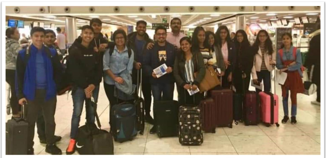
(Below) First set of 15 Irish delegates on their way to 5 th Mar Thoma Youth Conference at Yarnfield, Stone, Staffordshire.