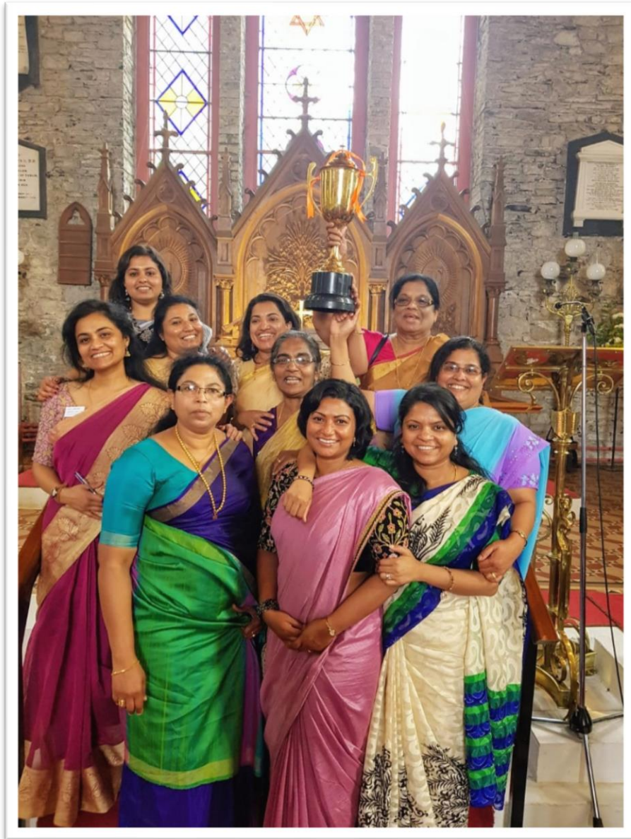
Winners of the Zonal SS Quiz Competition , Hermon MTC Sevika Sangham members with ever-rolling trophy