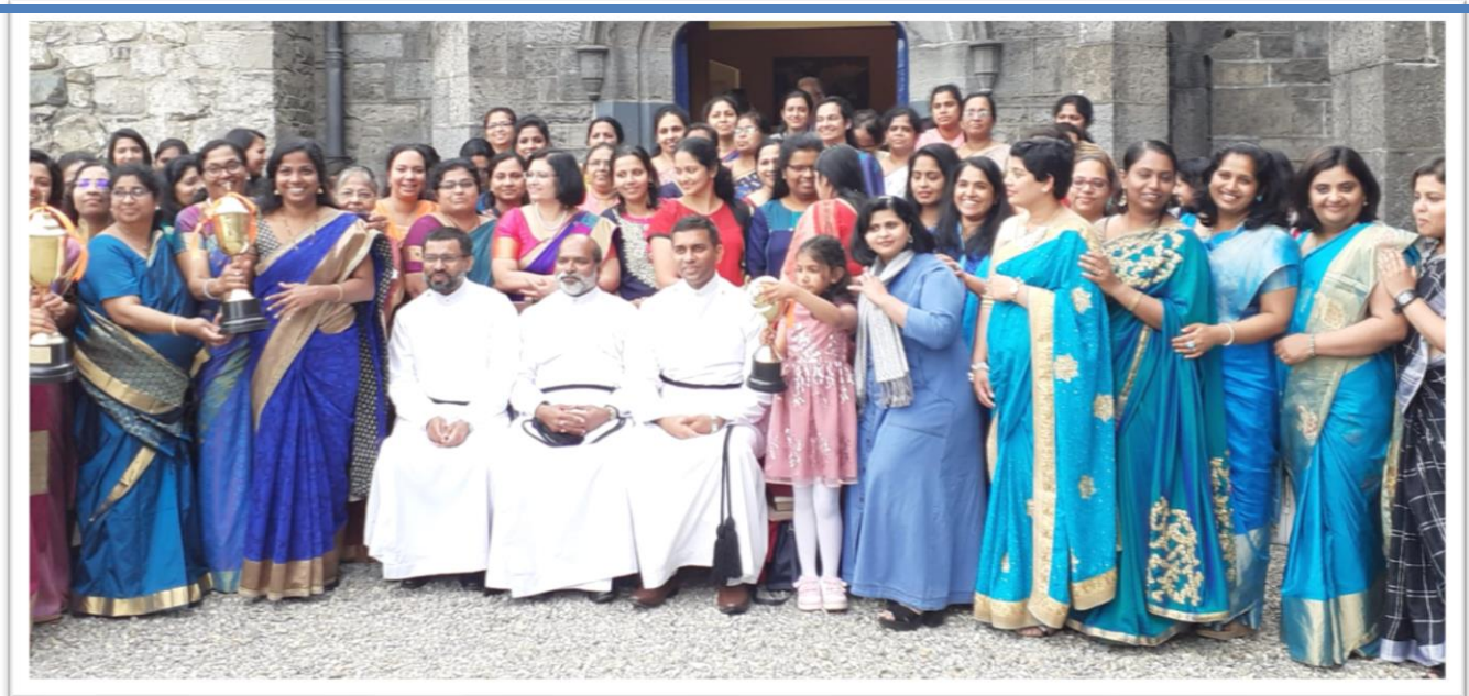
(Below) Participants from 1 st Zonal Sevika Sangham Meet on 29th June 2019, St. Maelruain's Church, Tallaght